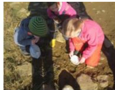
Whose are those