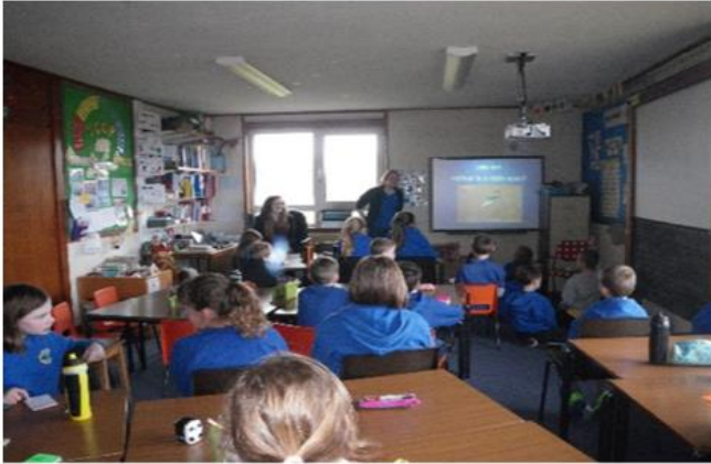
A Classroom Session

Number of pupils: 639 pupils (1,165) pupils if you count repeated visits to the same class / group