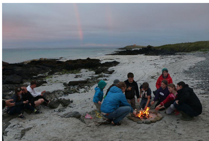
Marshmallow toasting at the Big Wild Sleep-Out