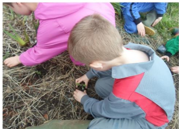
Planting a wildflower area in the school grounds for bumblebees