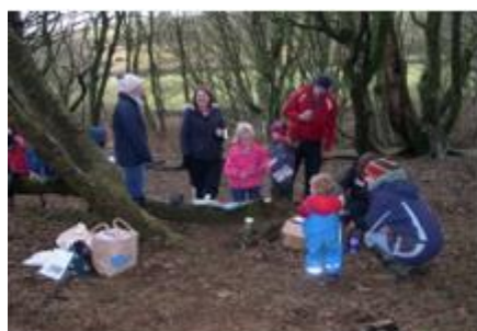
Wild scavenger hunt