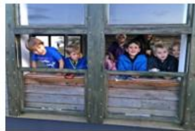
Bird Watching at Cottascarth