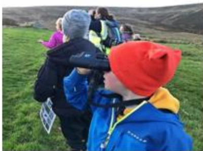
Big Garden Bird Watch