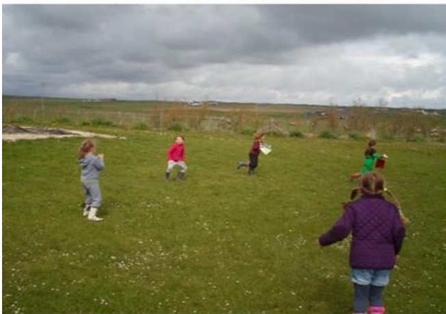
Playing a bumblebee game