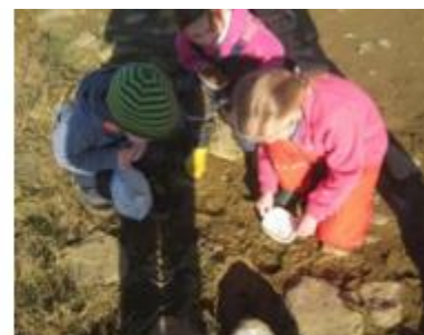
Whose are those