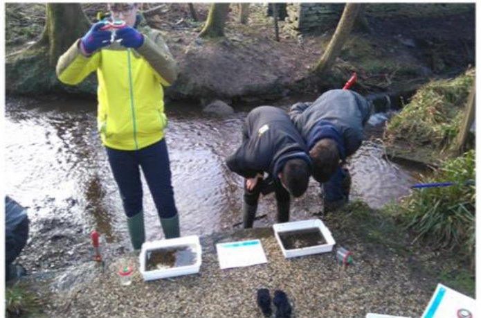
Kick sampling and identifying aquatic invertebrates