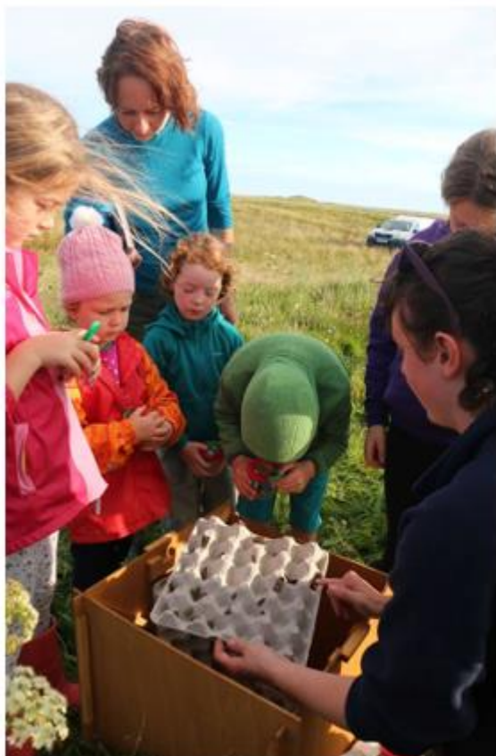
Moth magic at the Big Wild Sleep-Out