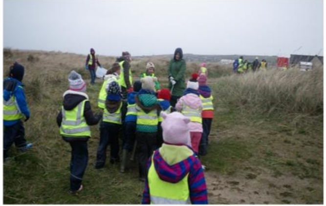
Clearing litter from the 4 th Barrier Beach