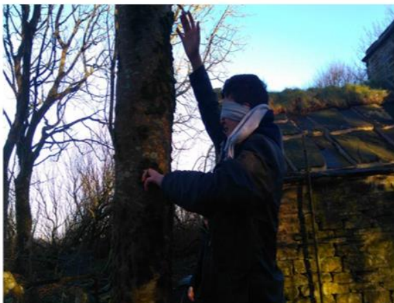
Using senses outdoors