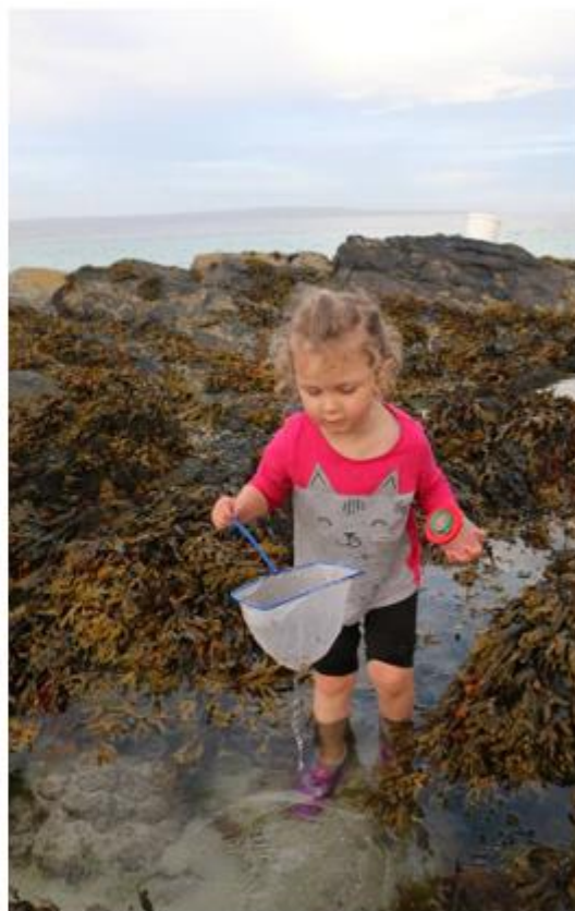
Rock-pooling at the Big Wild Sleep-Out